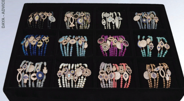
DAYA - ADVICE